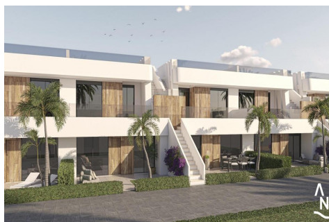
BUNGALOW TIPO B Vivienda 02-04-06-08