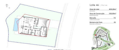
Implantação | Site Plan