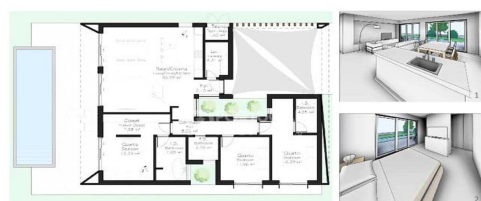
Rés do chão | Ground floor