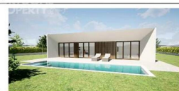
Posterior - Rear View